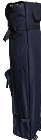
Roller Bag Included